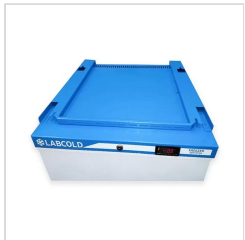
Labcold Stacking Kit